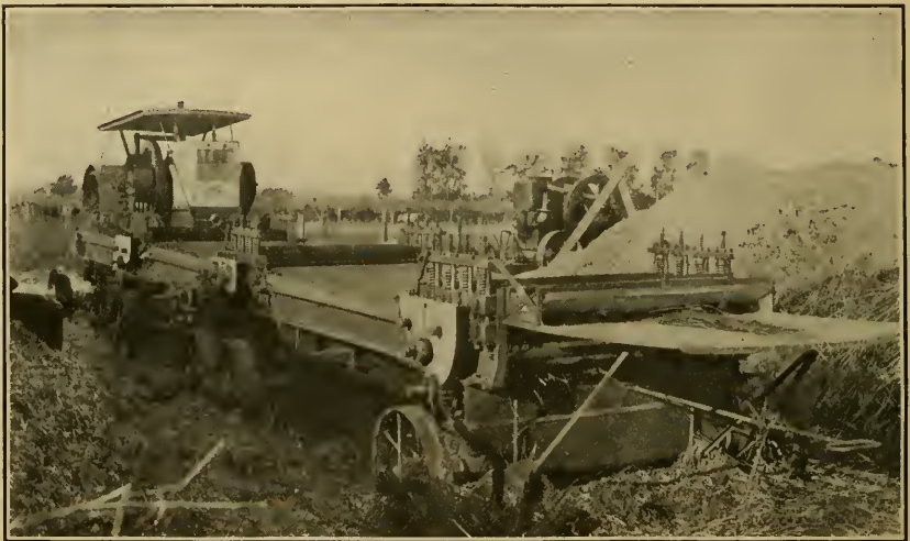
FIG. 2.—Machine brake and hemp hurds. Hemp hurds from machine brakes quickly accumulate in large piles.

Machine brakes are used in Wisconsin, Indiana, Ohio, and California, but to only a limited extent in Kentucky. Five different kinds of machine brakes are now in actual use in this country, and still others are used in Europe. All of the best hemp in Italy, commanding the highest market price paid for any hemp, is broken by machines. The better machine brakes now in use in this country prepare the fiber better and much more rapidly than the hand brakes, and they will undoubtedly be used in all localities where hemp raising is introduced as a new industry. They may also be used in Kentucky when their cost is reduced to more reasonable rates, so that they may compete with the hand brake. Hemp-breaking machines are being